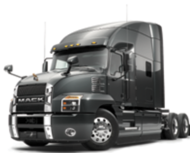
Mirror Chrome Bright